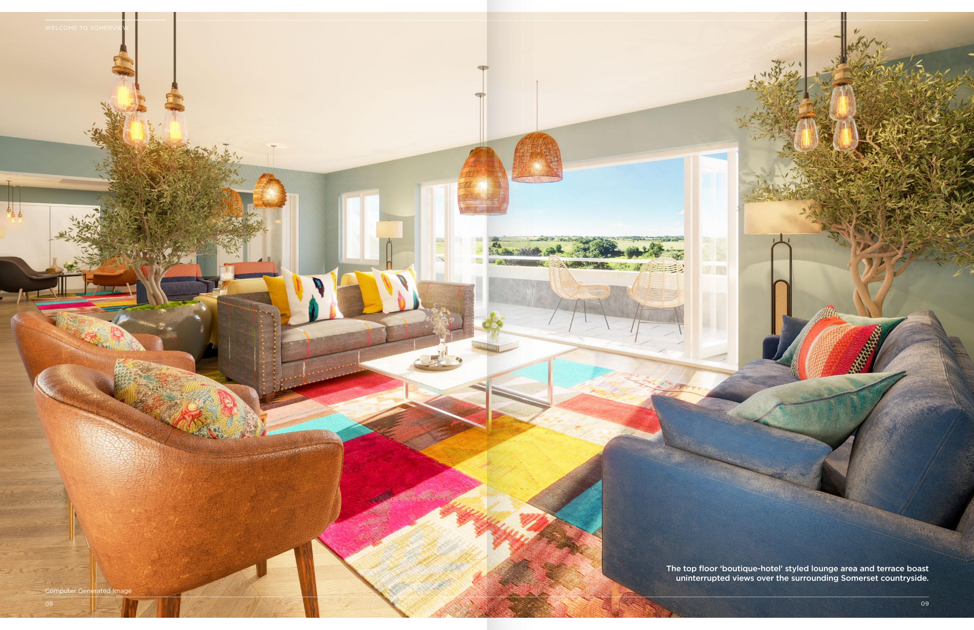
The top floor 'boutique-hotel' styled lounge area and terrace boast uninterrupted views over the surrounding Somerset countryside.