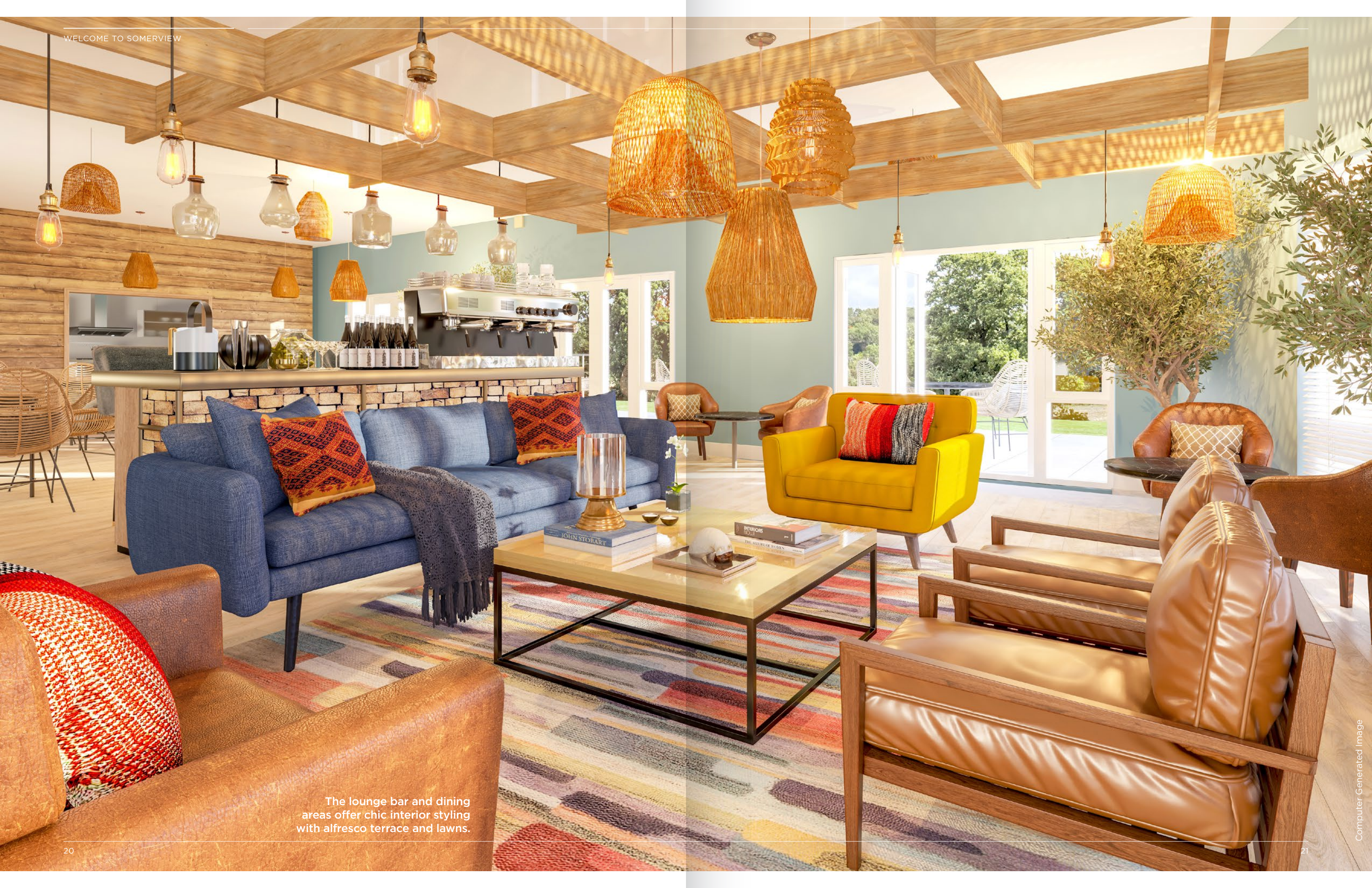
The lounge bar and dining areas offer chic interior styling with alfresco terrace and lawns.