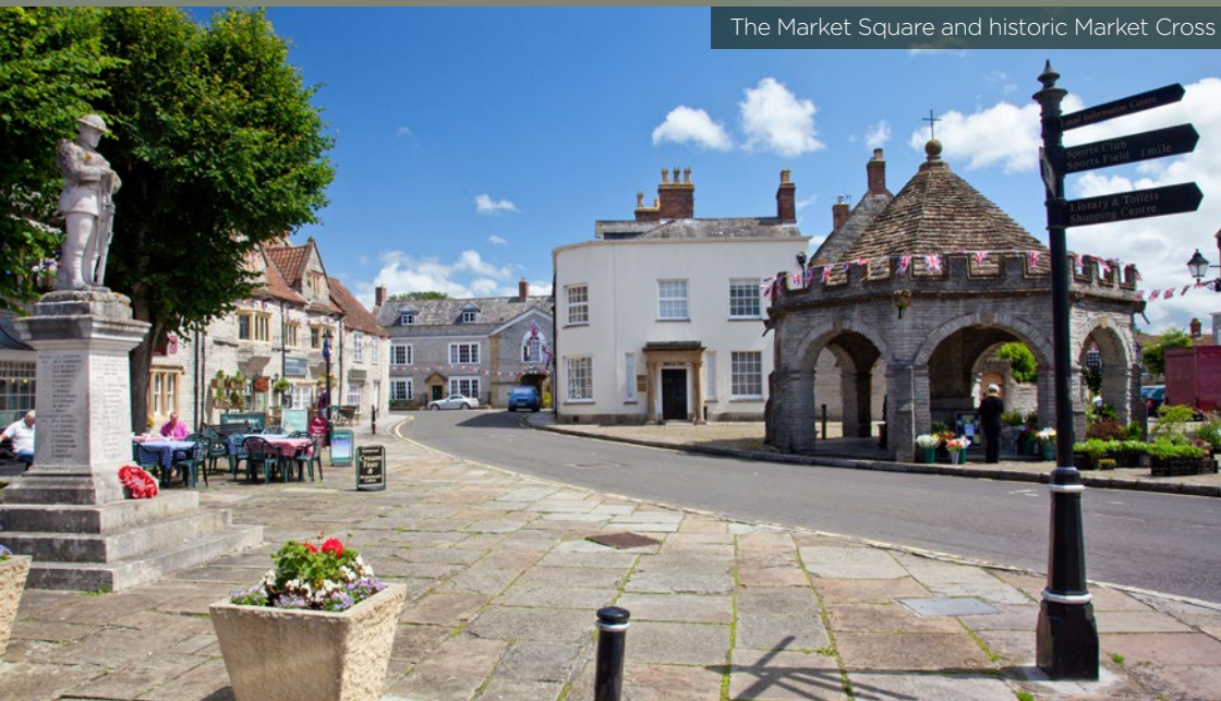
The Market Square and historic Market Cross