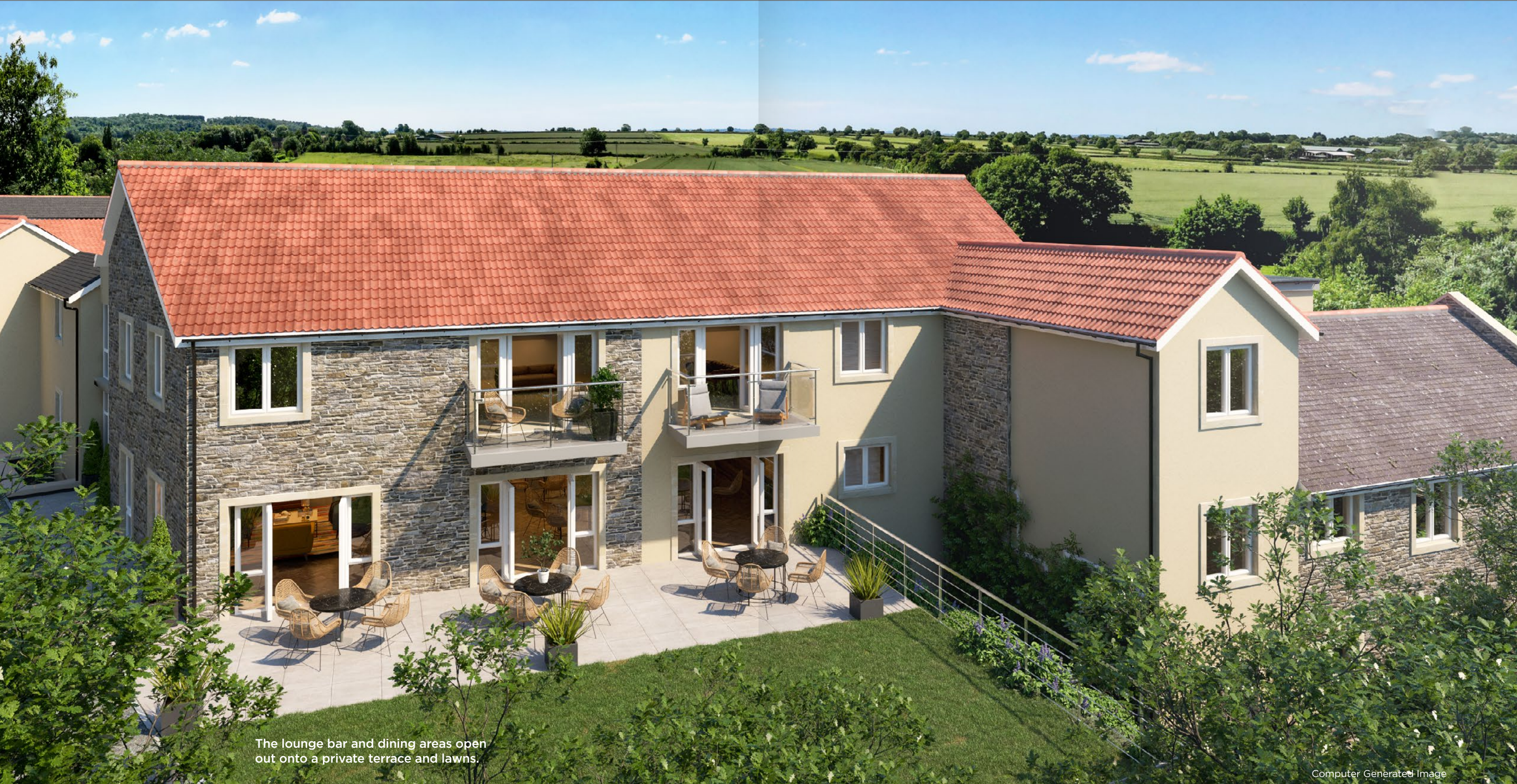
The lounge bar and dining areas open out onto a private terrace and lawns.