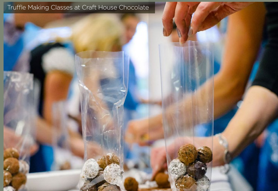
Truffle Making Classes at Craft House Chocolate