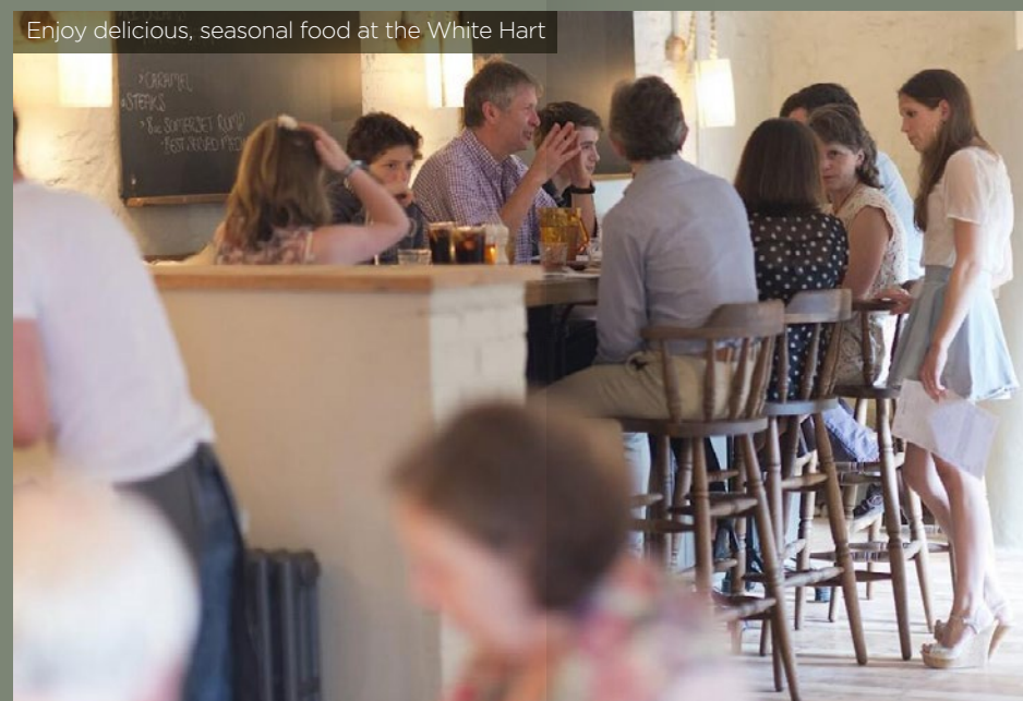
Enjoy delicious, seasonal food at the White Hart