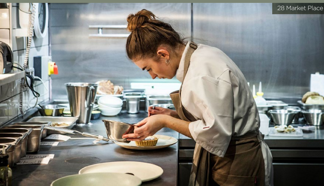
28 Market Place