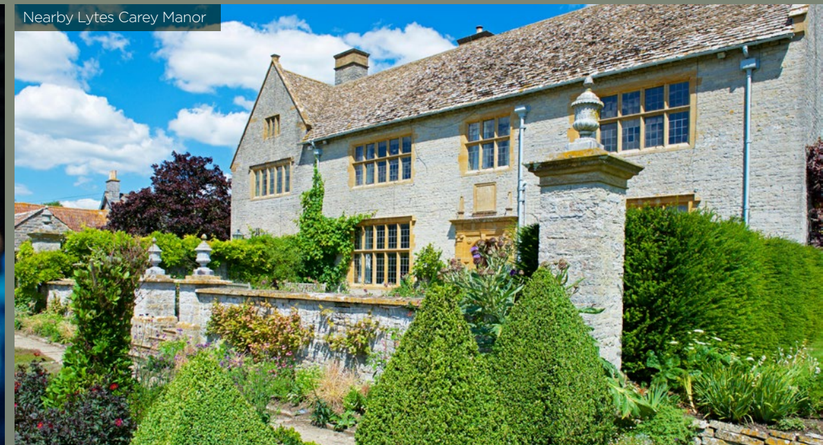
Nearby Lytes Carey Manor